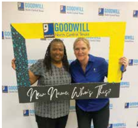
Goodwill NCT Staff celebrate the organization's name change.