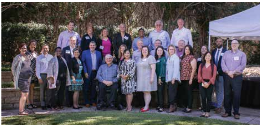
The Texas Association of Goodwills shared great ideas at the Fall meeting at Goodwill NCT's campus.