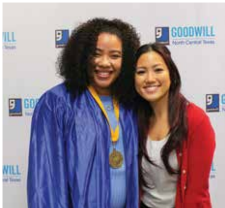
Goodwill Staff and Student celebrate at Fall graduation ceremony.